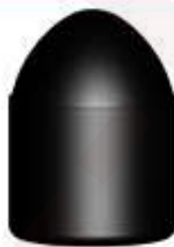
Semi Ballistic Button